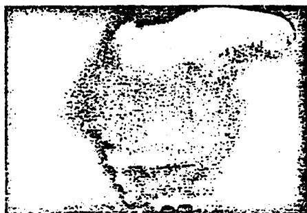
The UFO about to pass behind a nearby tree ...