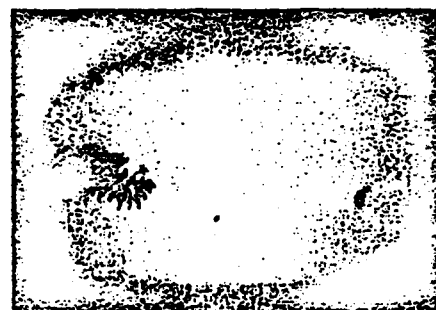
... and moving off into the distance.

In IUR, Vol. 2, No. 11, the Foreign Forum feature mentioned a case wherein a Guatemalan camera crew videotaping a car commercial turned